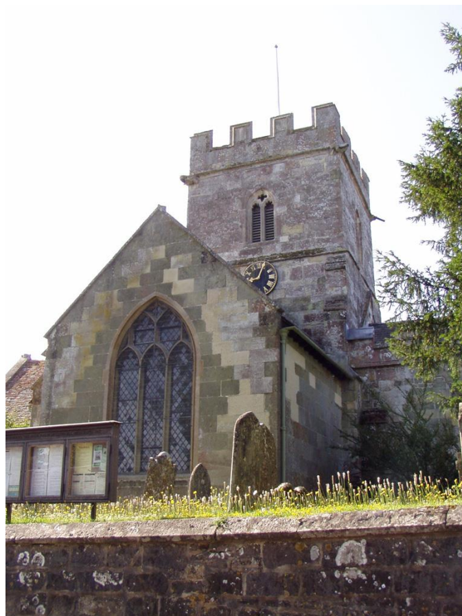
Barford St. Martin Church

This cemetery belongs to the Church, and is on the North side of the village. There are 10 Commonwealth War Graves in this Cemetery – 9 from World War 1 (4 Australian Soldiers) & 1 connected to World War 2.