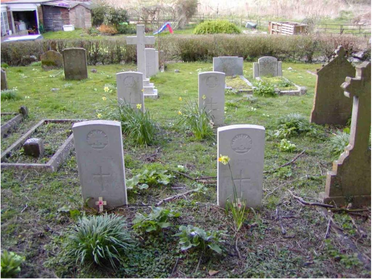
Barford St. Martin Church Cemetery